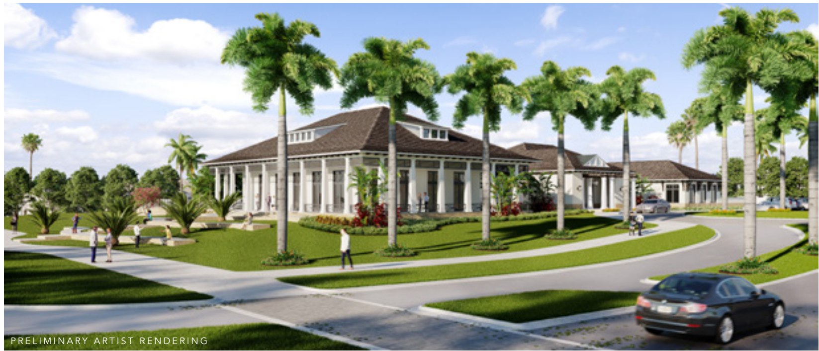
PRELIMINARY ARTIST RENDERING