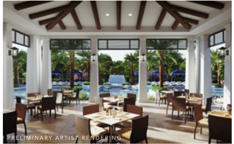
PRELIMINARY ARTIST RENDERING