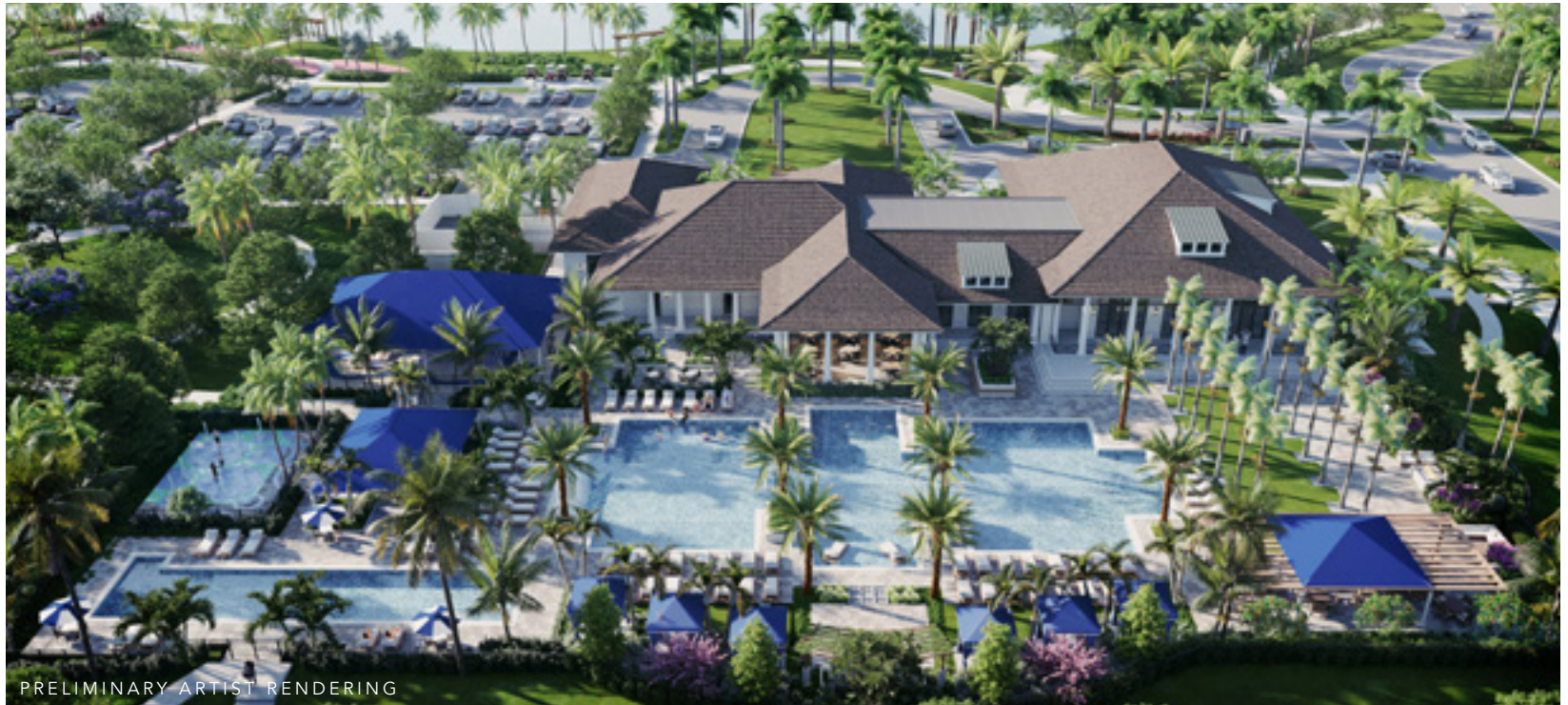
PRELIMINARY ARTIST RENDERING