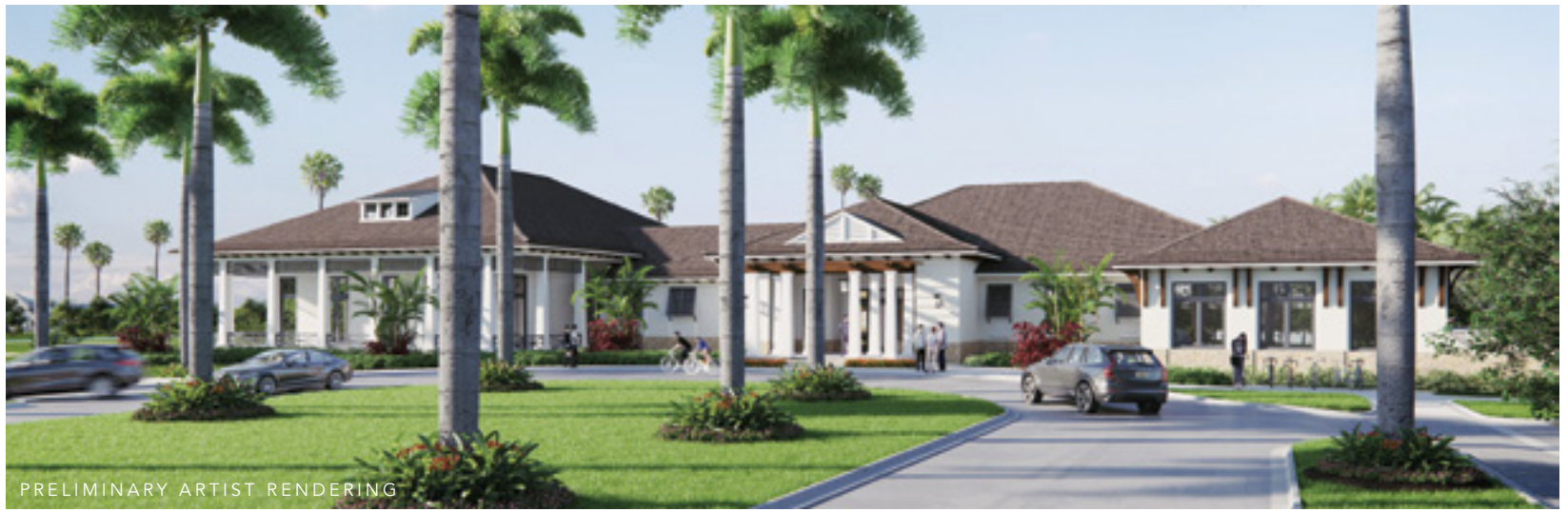
PRELIMINARY ARTIST RENDERING